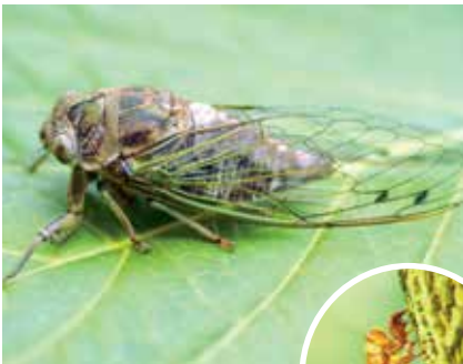
Cicada after molt